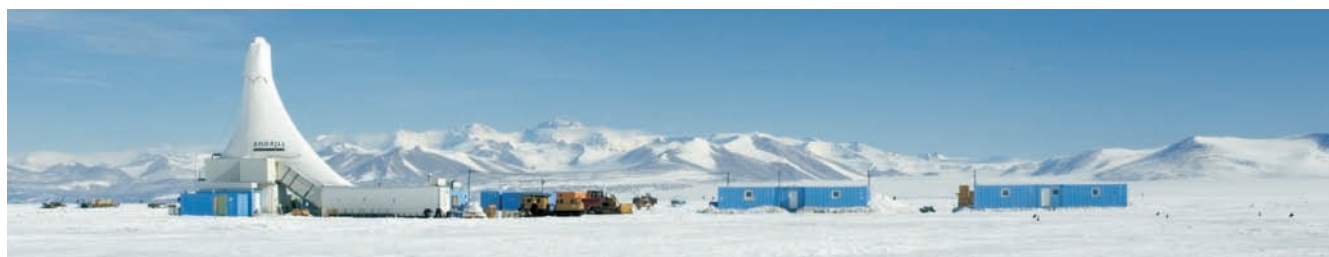
Figure 1. Panoramic image of the ANDRILL drilling rig and science laboratories in Southern McMurdo Sound during late 2007, operating from a 8.4-meter-thick sea-ice platform. Transantarctic Mountains are visible in the background.

In addition to the 600-m-thick middle Miocene interval (800–223 mbsf) , the AND-2A drill core also recovered an expanded lower Miocene section (1138.54 up to c. 800 mbsf) through an interval previously recovered during the Cape Roberts Project and an upper Pliocene to Recent interval (223 mbsf to 0.0 mbsf) that is thinner but correlative to parts of the Upper Neogene section recovered by the ANDRILL MIS Project in drill core AND-1B. Abundant volcanic clasts and tephra layers in the core, also provide the materials to document the 20-million-year evolution of the McMurdo Volcanic Province including several previously unknown explosive volcanic events.