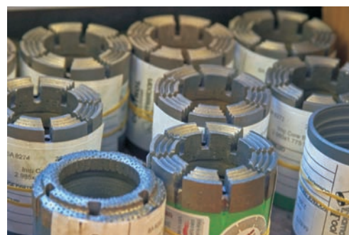
Figure 4. Diamond-impregnated drilling bits enable the ANDRILL drilling system to recover high-quality core, with up to 98% core recovery through glacial and glaci-marine sediments.