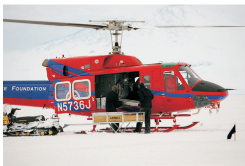
Figure 3. ANDRILL sediment cores were flown by helicopter daily from the drillsite to the Crary Science and Engineering Center at McMurdo Station.

Programs like ANDRILL can help constraining uncertainties about the future behavior of Antarctic ice sheets and resultant sea-level change. These stratigraphic records will be used to determine the behavior of ancient ice sheets and to better understand the factors driving past ice sheet, ice shelf, and sea-ice growth and decay. This knowledge will enhance our