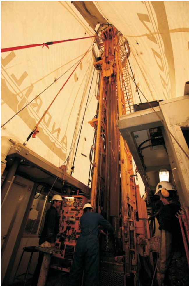
Figure 5. Drilling operations under the ANDRILL drill-rig canopy.

Nebraska-Lincoln. Scientific studies are jointly supported by the U.S. National Science Foundation , NZ Foundation for Research , the Italian Antarctic Research Program, the German Science Foundation, and the Alfred Wegener Institute . For more information, please visit the ANDRILL website at http://andrill.org .