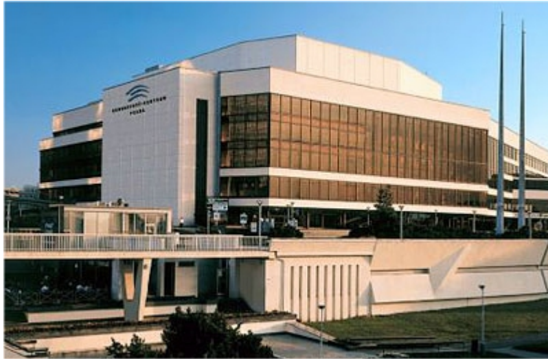
Prague Congress Centre