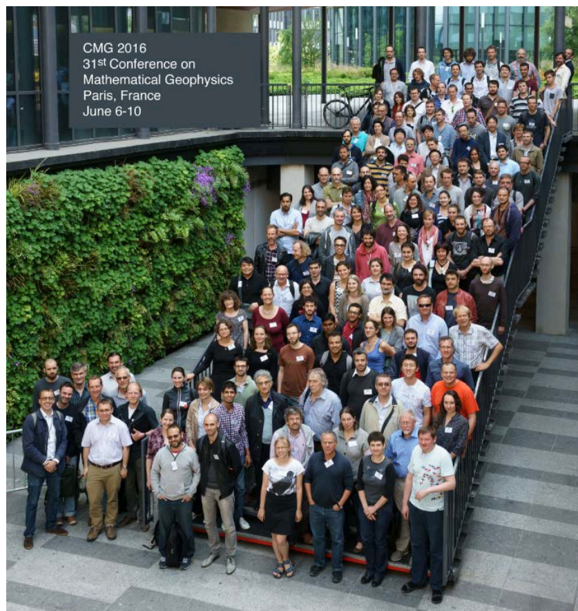
CMG 2016 Meeting participants

The IUGG Union Commission on Mathematical Geophysics (CMG) held its 31 st Conference during 6-10 June at Université Pierre et Marie Curie in Paris, France. The CMG biennial meetings take place all over the world and cover key contemporary issues in mathematical geophysics, embracing the solid Earth, ocean, atmosphere, climate, planetary, engineering, and applied math communities. This year's meeting had a strong emphasis on computational and experimental science. In particular, it reached out to experimental science communities via a special session on " Experimental Geophysics ", which focused on bridging the gap between theory and field observation. The scientific program included 16 special sessions divided into four thematic blocks: Earth System and Planets , Fluids and Granular Flows , Seismology , Tectonics and Rock Mechanics , and Cross Disciplinary Approached, Methods, and Data .