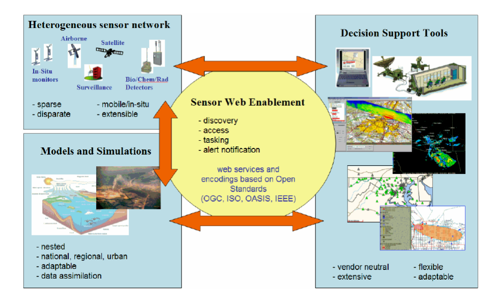
Figure 1: The role of the Sensor Web Enablement framework [3]

A recent addition to the OGC geospatial web services is the Sensor Web Enablement (SWE) initiative, a framework of open standards for exploiting Web-connected sensors and sensor systems of all types: flood gauges, air pollution monitors, Webcams, satellite-borne earth imaging devices and countless other sensors and sensor systems [3]. SWE is still under development and several open source applications are already available. A list of currently available SWE components can be found on the OGC website (http://www.opengeospatial.org/).