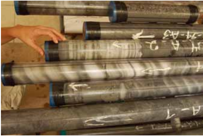
Figure 2. Drill cores in liners recovered at depth around 300 m below lake floor. From top to bottom the cores show change from gravel (top core) to marls interlaced with fine-grained salt layers (middle cores). This suggests that at that time the shore was very close to the drilling site, and the wavy salt patterns were interpreted as a result of salt flow.

plementary record to the sections recovered from the marginal terraces, particularly for time interval of low lake stands when the lake retreated from the marginal terraces. The calcium chloride brine that was produced during the ingress of the Sedom lagoon is poor in bicarbonate and sulfate, and therefore, when freshwater enters the lake, primary aragonite is deposited. The aragonite provides an excellent and unique means to achieve calendar chronology down to a few hundred thousand years. This illustrates a major advantage of the sedimentary archive of the Dead Sea and allows comparison to global records such as ice cores and deep sea cores. Data from core samples will establish a pattern of abrupt hydrological events in the drainage area, and the brine-freshwater relations during the different stages will be explored to evaluate effects of long-term climatic trends versus short-term fluctuations.