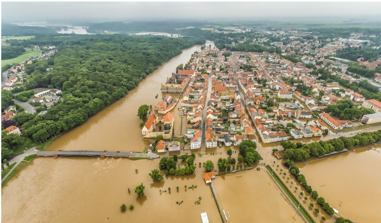
Large-scale flood in the Elbe basin, Germany, in June 2013. The City of Grimma.

Evolutionary leap in flood risk assessment methodologies is needed to reliably quantify real large-scale risk used to inform national and river basin policies worldwide.