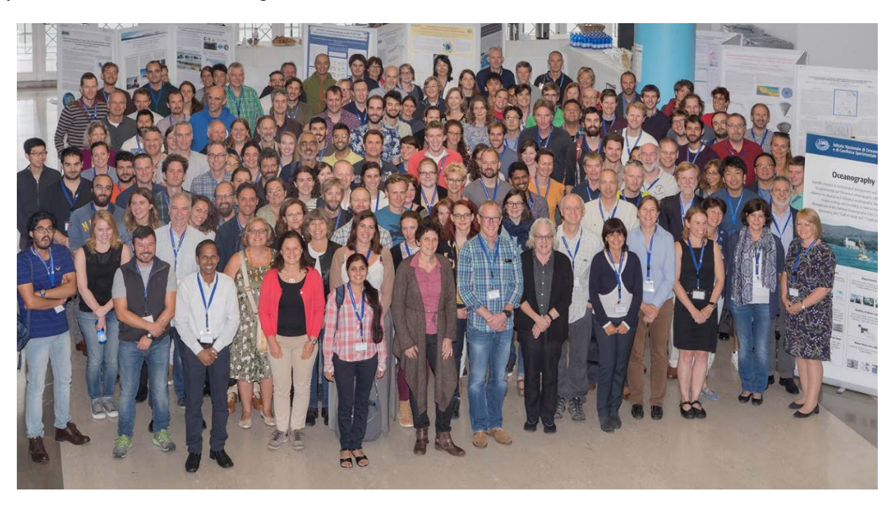
A group photo of the conference participants

ice sheet and sea-level change, and identified the research gaps and future priorities for the next phase of the SCAR research programmes. Specific emphasis was placed on the research priorities of the Intergovernmental Panel on Climate Change (IPCC), Antarctic Treaty System (ATS), and the recent SCAR Horizon Scan. Keynote speakers highlighted new multidisciplinary research directions related to the impact of Antarctic ice sheet and climate change on biological systems, on the global climate system and on sea-level change.