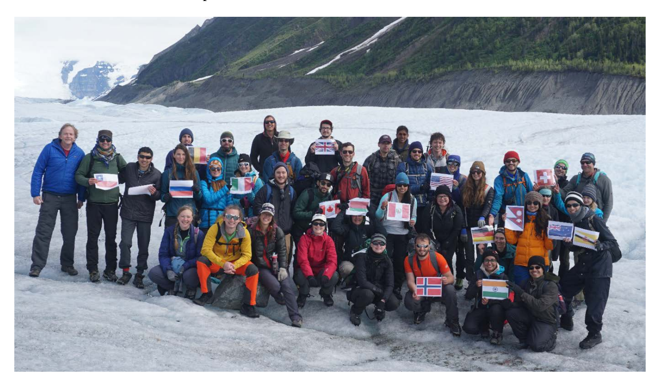
Group photo

Nearly 30 graduate students from more than 25 universities and 17 countries as far away as Nepal, India, Peru and New Zealand gathered in the small Alaskan village of McCarthy from 5 to 15 June 2018 to participate in the University of Alaska Fairbanks's (UAF) Fifth International Summer School in Glaciology. Steep ice-covered mountains provided the perfect setting to equip early stage PhD students with tools to address the expanding challenges in quantifying and modeling rapid changes in glaciers and ice sheets occurring in response to a warming climate, and to foster collaboration among students as well as established scientists in the field of glaciology. All eight instructors from the glaciology group at UAF, and three other US universities and institutions, stayed for the entire period, offering plenty of opportunity for interaction between the instructors and students during and outside the formal instruction period.