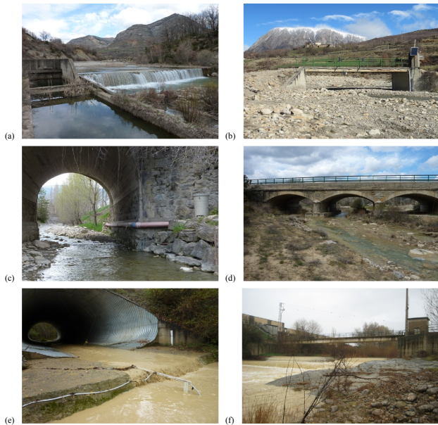
Figure 3. View of stream gauging stations ( a : Cabecera, b : Villacarli, c : Carrasquero, d : Ceguera, e : Lascuarre, f : Capella).

served after heavy floods. The times of these changes have been reconstructed manually; the respective difference to the effective flow level has been added as offset information in the database. Thus, both the absolute water level h_{\text{abs}} and the effective water level h_{\text{eff}} can be retrieved with