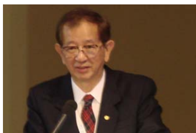
Yuan Tseh Lee