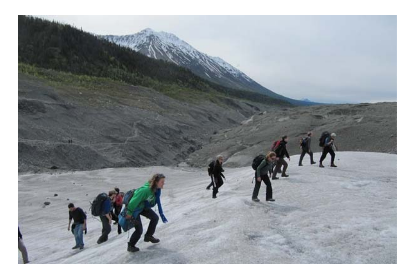
Walking on the Root Glacier

easily accessible glaciers. Students came from a wide range of educational backgrounds such as geography, geology, mathematics, physics and engineering. Many of the students are enrolled at universities where glaciology courses are not offered at all. Hence, the workshop provided an opportunity for these students to obtain a holistic education in a wide range of glaciological topics that reaches beyond the scope of their graduate thesis work. The workshop provided a comprehensive overview of the physics of glaciers and current research frontiers in glaciology. Topics included glacier mass balance, meteorology, hydrology, glacier dynamics, ice-ocean interactions, glacier geology, geophysical methods, inverse modeling, and remote sensing of glaciers and ice sheets. A focus was on modeling and quantitative glaciology.