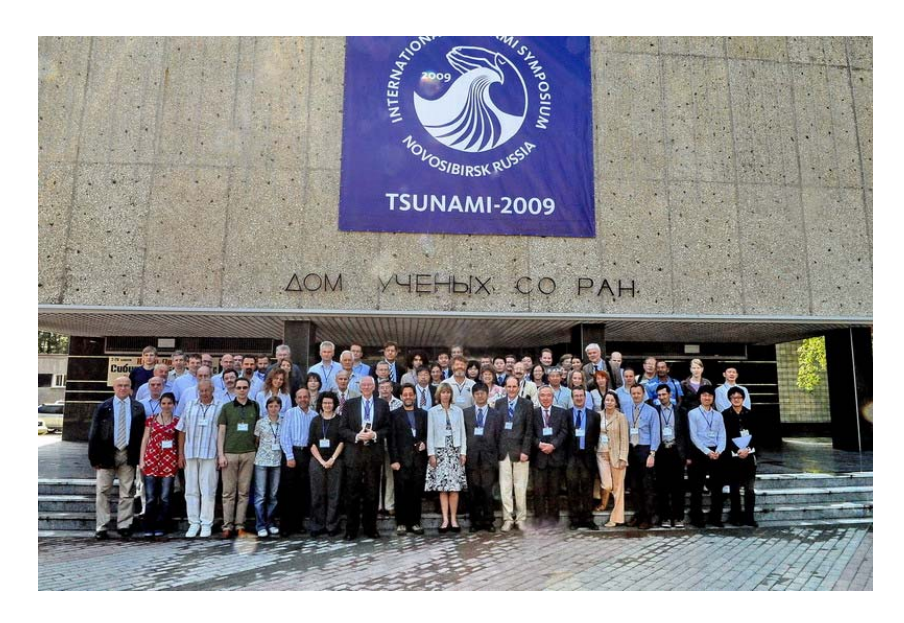
ITS-2009 participants at the entrance to the symposium venue

(coastal tsunami zoning): and 10. Tsunami mitigation and countermeasures. The Symposium's program can be downloaded from: <a href="http://tsun.sscc.ru/tsunami2009/program.html">http://tsun.sscc.ru/tsunami2009/program.html</a>.