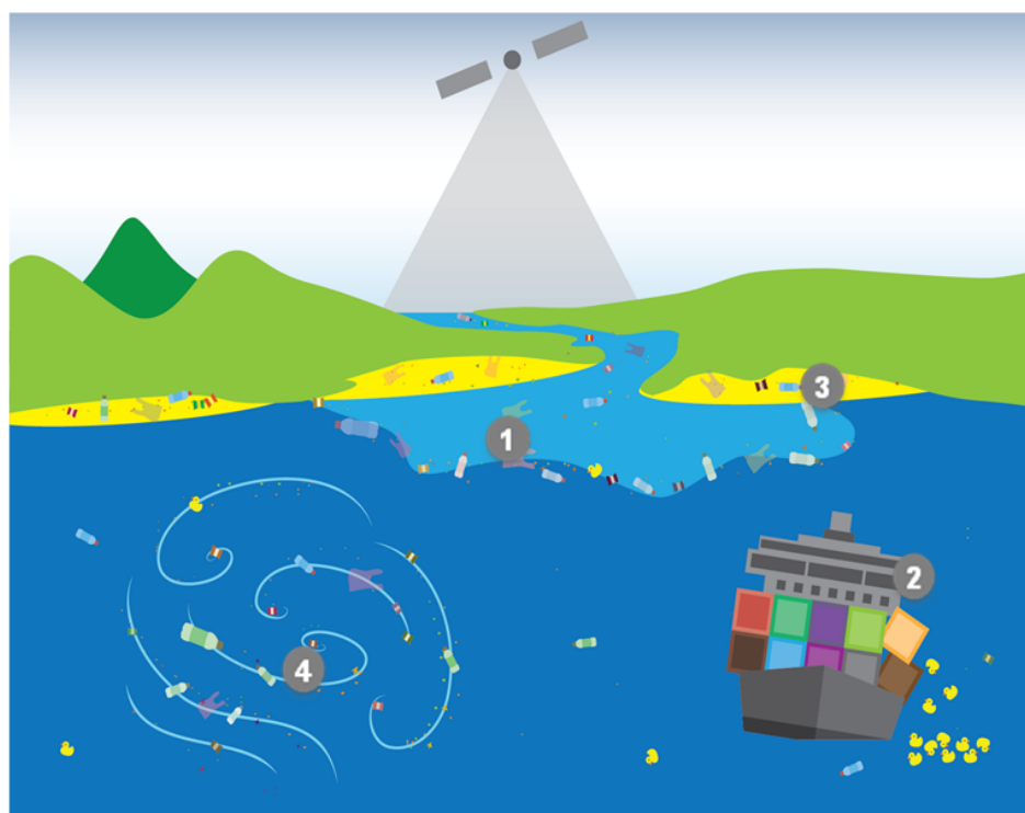
Figure 1. Diagram representing the four observational scenarios discussed in the text (Section 2). (1) River discharge, (2) spills, (3) shoreline accumulation, (4) submesoscale convergence filaments.

Table 1 summarises the link between questions, processes, their spatial and temporal scales and the observational requirements, while Figure 1 presents a graphical summary of the processes involved.