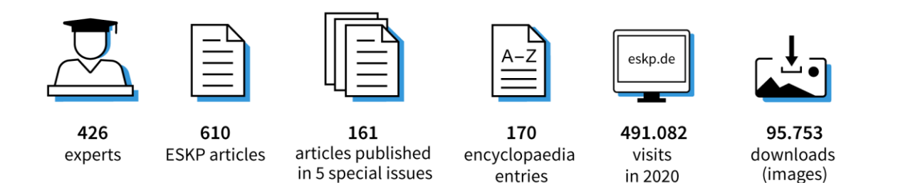
Fig. 3: An overview of some important ESKP key figures. (Illustration: Wissensplattform Erde und Umwelt, eskp.de)

Apart from its own Facebook account, ESKP also had a Twitter account: @geowissenschaft. The latter was characterised by a prominent and valuable follower structure. Among them there counted ministries, a number of institutionalised as well as independent research and educational institutions, publishers of scientific books, scientific communications actors, Helmholtz Centres and Institutes as well as, apart from enterprises and civil society actors, also many private people.