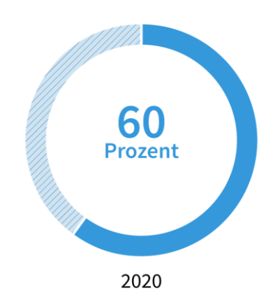
Fig. 1: Fig. 1: Sixty percent of Germans are interested in scientific topics, according to the 2020 <u>survey conducted</u> <u>by Wissenschaft im Dialog</u>. (Illustration: Wissensplattform Erde und Umwelt, eskp.de)

The ESKP websites eskp.de and themenspezial.eskp.de were provided by those centres as being involved in the Helmholtz Association's Earth and Environment research unit: Alfred-Wegener-Institut, Helmholtz-Zentrum für Polar- und Meeresforschung (AWI), Deutsches Zentrum für Luft- und Raumfahrt, German Aerospace Center (DLR), Forschungszentrum Jülich (FZJ), GEOMAR Helmholtz-Zentrum für Ozeanforschung Kiel, Helmholtz-Zentrum Potsdam - Deutsches GeoForschungsZentrum (GFZ), Helmholtz-Zentrum Geesthacht, Zentrum für Material- und