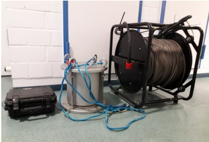
Figure 3: “Mobile Ocean Bottom Seismometer” (MOBSI) system: cable drum (right), broad band seismic sensor & data logger (middle) and control unit/computer (left). Modified from Ryberg et al., 2018.

Positions were taken by handheld GNSS with an estimated accuracy of 3 to 5 m. Water depth was determined by an echo sounder, taken by a bathy-boat (Cable, 2022, in preparation) or from the near-by resistivity measurements (Overduin et al., 2022, In preparation).