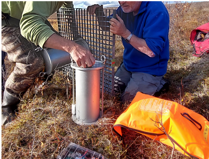
Figure 3: Shallow water ocean bottom seismometer. The cylinder containing the recorder and sensor is mounted on a metal grid.