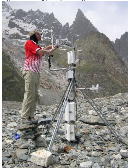
Installing eddy-covariance instruments on the debris cover of the Miage glacier, Italy