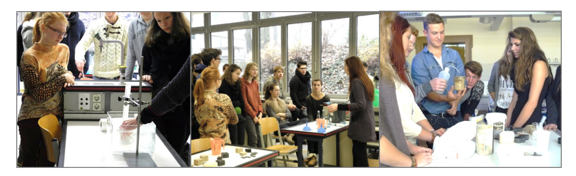
Fig. 5. GFZ staff teaches pupils about CO2 storage and the research at the Ketzin pilot site

The public relations work has been expanded in 2012 by GFZ visiting schools and discussing with teachers and pupils on motivations, activities and results of the Ketzin project (Fig. 5). In order to appropriately present the project we use short films about the pilot site (see also chapter 3.5) besides a presentation which is adapted to the young listeners. With hands-on experiments the pupils can also experience different rock materials and their properties (reservoir and cap rock) and learn more about the gas carbon dioxide itself and the processes taking place in the underground during the storage.