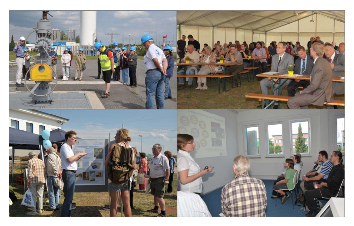
Fig. 4. Impressions of an annual open day at Ketzin; during guided tours (left) and scientific talks (right)

Since 2011, an annual open day at the pilot site presents the research on CO<sub>2</sub> storage at Ketzin. Visitors can learn about the current status of the research activities at a variety of information booths, during guided tours, presentations and