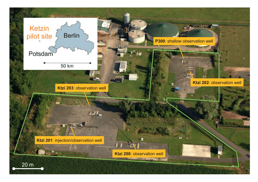
Fig. 1. Ketzin pilot site: Location and aerial view with well infrastructure in July 2014